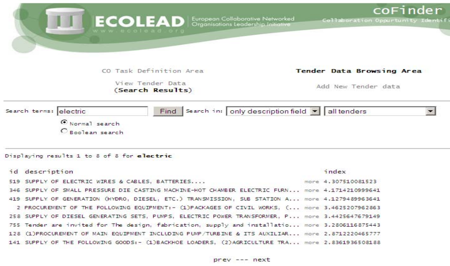
Figure 6: Searching through collected CfTs

answers of one of the end-users. However, most end-users also agree that coFinder should be made easier to use, so we still have to improve on its user interface.